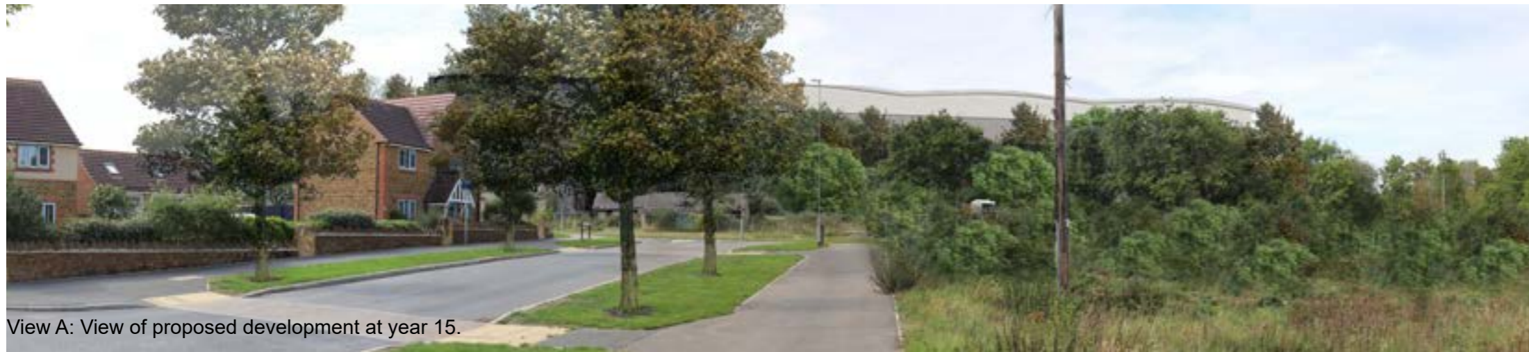
View A: View of proposed development at year 15.