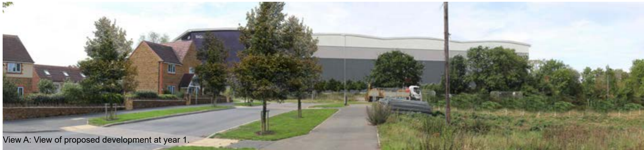
View A: View of proposed development at year 1.