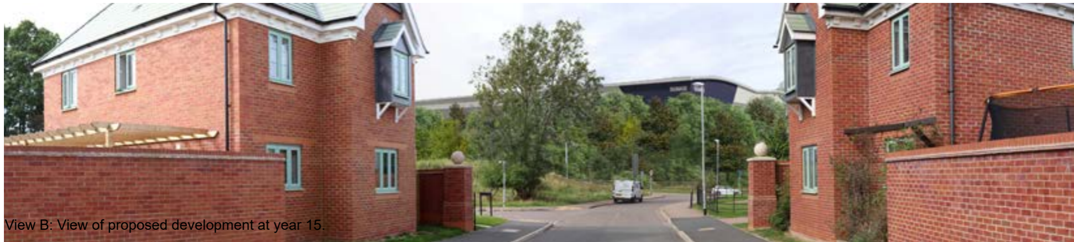
View B: View of proposed development at year 15.