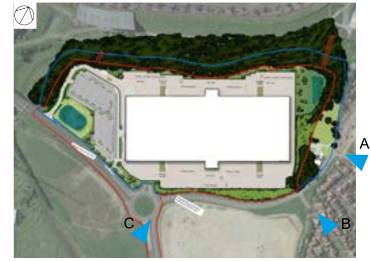
Location of viewpoints