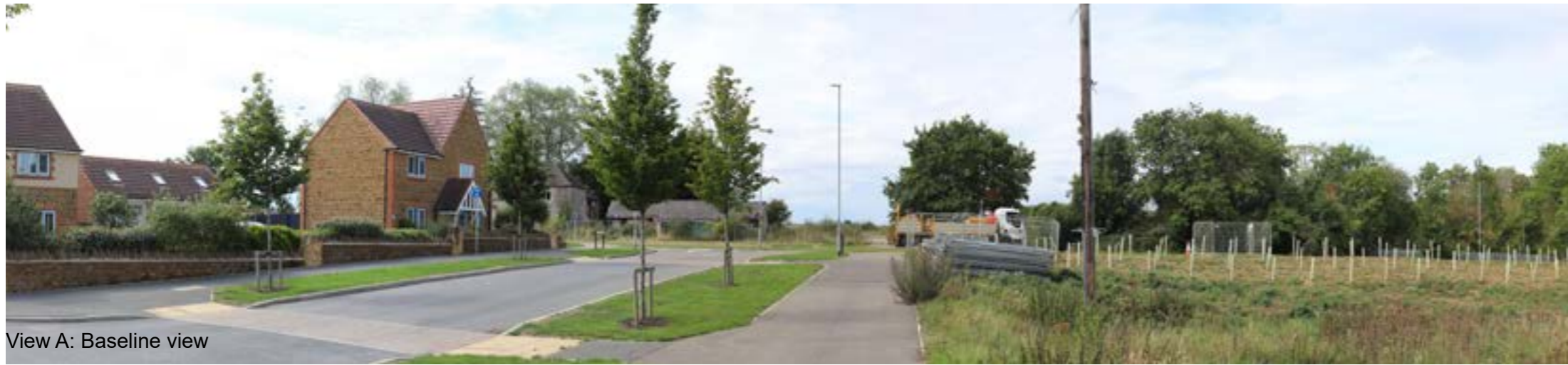
View A: Baseline view