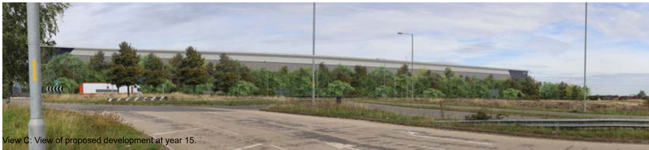
View C: View of proposed development at year 15.