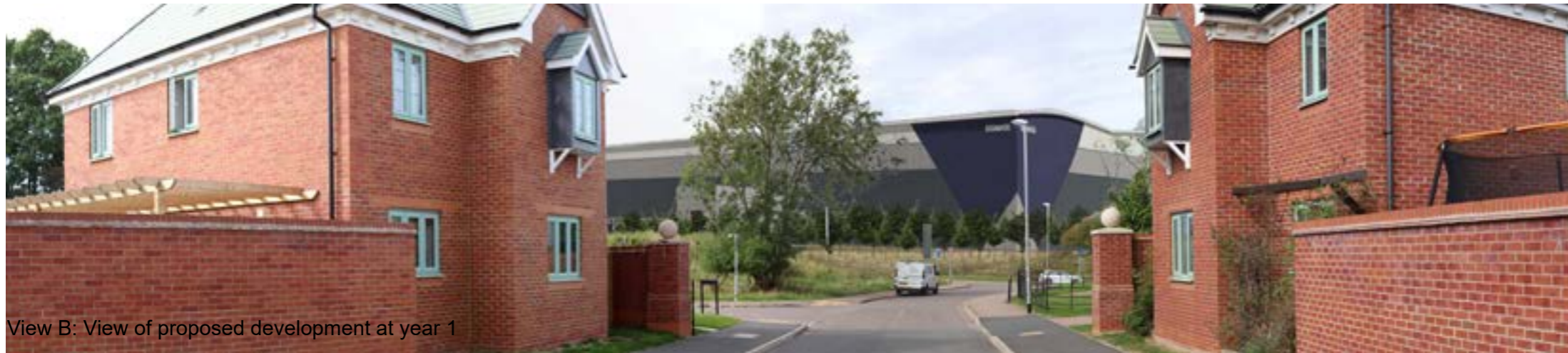
View B: View of proposed development at year 1