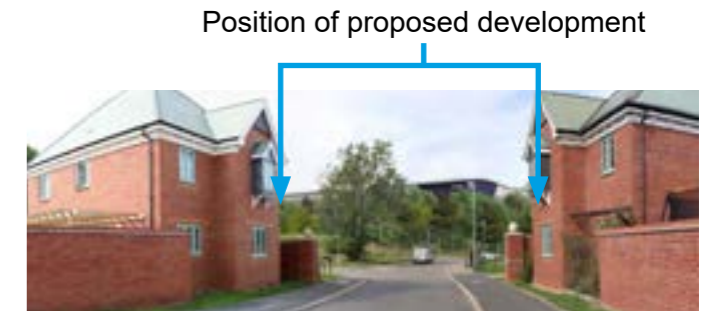
Position of proposed development