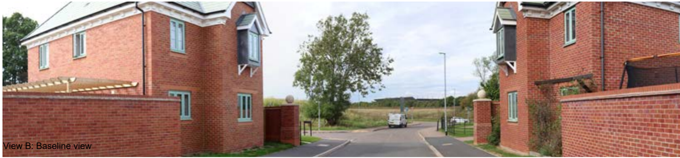
View B: Baseline view