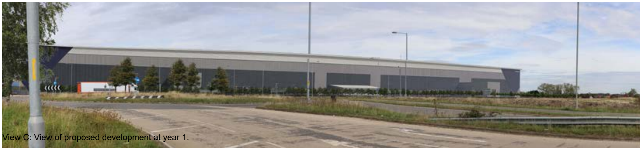
View C: View of proposed development at year 1.