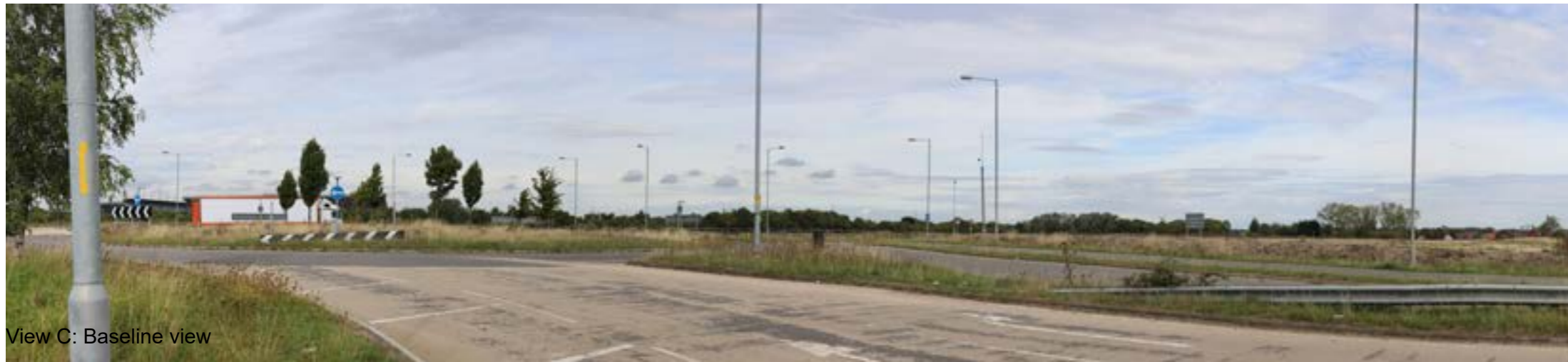
View C: Baseline view